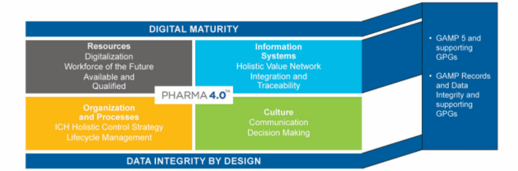
Figure 1.1: Pharma 4.0 [13]